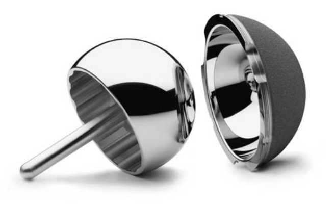
Fig. 1 Durom hip resurfacing system.

Blood, serum and erythrocyte sampling. Venous whole blood samples were collected pre-operatively, and at three, six, 12 and 24 months post-operatively. In addition, we collected serum and erythrocyte samples at 12 and 24 months. One week before blood collection, the patients were asked not to modify their exercise routine or to engage in new, strenuous activities, take new medications, or undergo other venous sampling. The vein was cannulated with a 22-gauge stainless steel needle (BD insyte, Ref. No. 381223; Beckton Dickinson infusion therapy systems Inc., Sandy, Utah), and the outer plastic cannula was left in place while the needle was discarded. To avoid contamination from the needle, the first 5 ml of blood withdrawn were discarded. Three 5 ml samples were collected in individual plastic syringes (BD syringes Luer Lok Tip, Ref No. 309604; Beckton Dickinson infusion therapy systems Inc., Franklin Lakes, New Jersey) by a research nurse. For serum and erythrocyte samples, whole blood was centrifuged at 3000 rpm for 15 minutes. All samples were transferred to individual SARSTEDT polypropylene tubes (SARSTEDT Inc., St. Leonard, Canada) in a sterile environment and kept frozen at -20°C. All samples (whole blood,